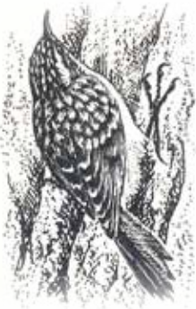
Tree Creeper - Turnnicliffe

Let's enjoy these longer warmer days while they last. We're so lucky here to be relatively well wooded, and with recent new plantings of mixed hedgerows we can perhaps hope to hold on to our varied wildlife in future – and maybe encourage even more.