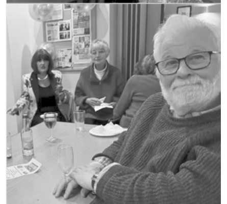
TOFT SOCIAL CLUB CELEBRATES 25 YEARS SINCE ITS FOUNDING