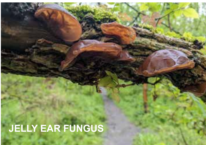
JELLY EAR FUNGUS

Jelly ear (sometimes called wood ear): a pinkish brown gelatinous bracket fungus, that looks a bit like a group of ears! They grow on decaying branches, especially elder.