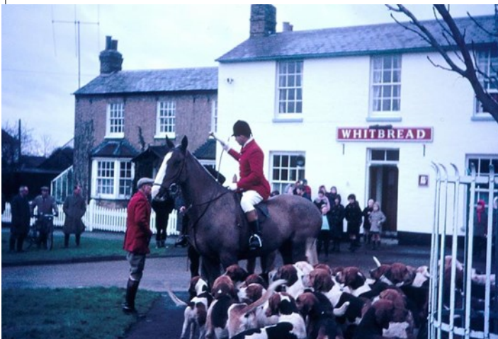
Cambridgeshire Hunt in Toft 1969

Foxes were also considered pests, causing considerable harm to livestock, particularly poultry and sheep, which in the past were kept in open fields. The hunting of foxes on horseback was an exhilarating sport whilst also serving to control the fox population. Supporters followed the local Hunt on foot, bicycle, and, in more recent times, car. Such gatherings were a social occasion in themselves as they passed through villages (see below) and were linked to other events such as Hunt Balls and Point-to-Point racing.