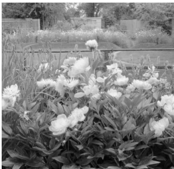
Colm Sheppard's garden

Please come and visit. Entrance is £5.00 for all four gardens (children free).