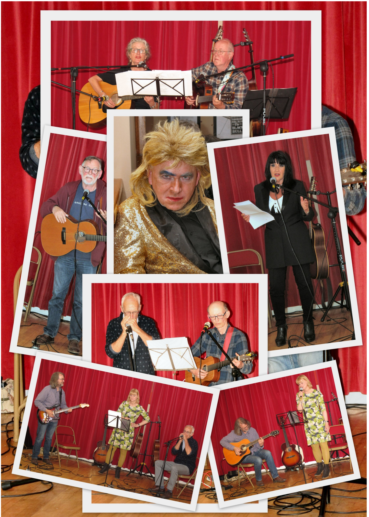
Ain't Mis-Behavin' - Just Entertainin'...The Open-Mic night in May.