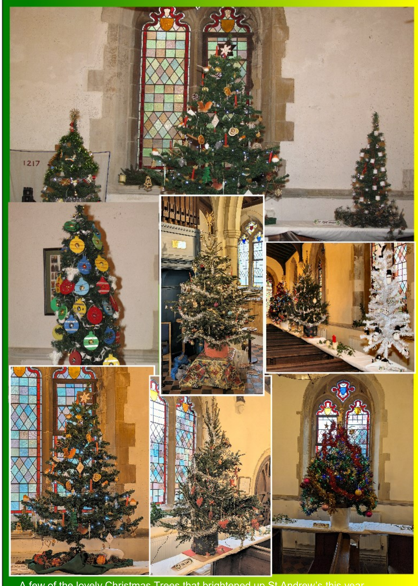
A few of the lovely Christmas Trees that brightened up St Andrew's this year.