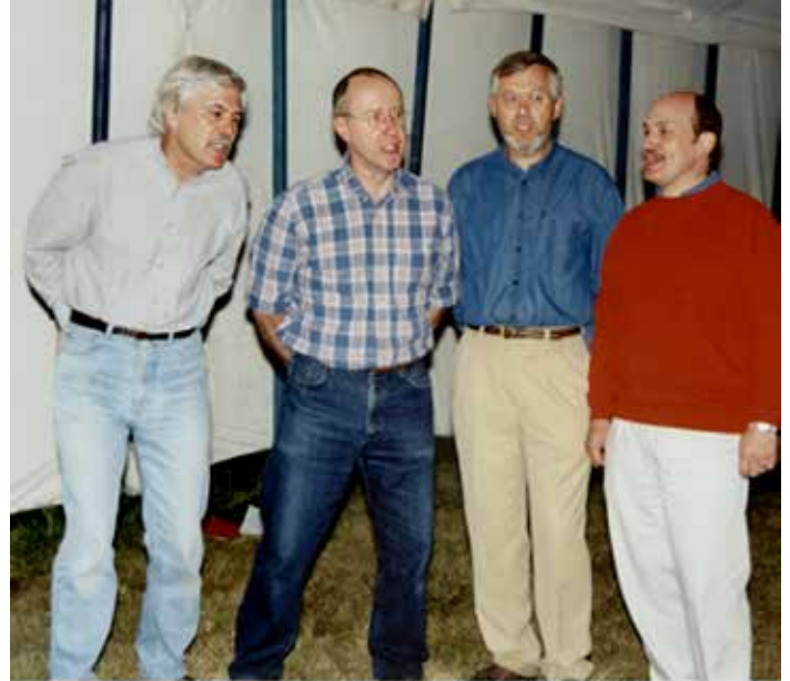
Ceilidh at Firs Farm. July 1st 2000.