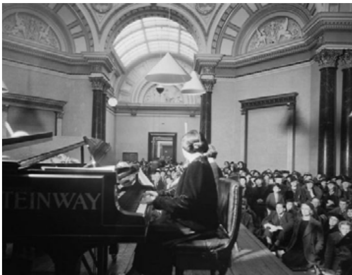
Myra Hess performs at a live lunchtime concert at the National Gallery during World War II

On the first day, not knowing how things would work out, Hess gave the concert herself. Hoping for some sort of audience, despite the terrible stress of war and its hazards and with minimal publicity, Hess was astonished to see around 1,000 people queueing on Trafalgar Square, hoping to attend the concert.